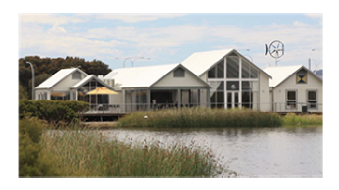
THE WATERSHED FUNCTION CENTRE & CAFE 665 Salisbury Highway MAWSON LAKES SA 5095